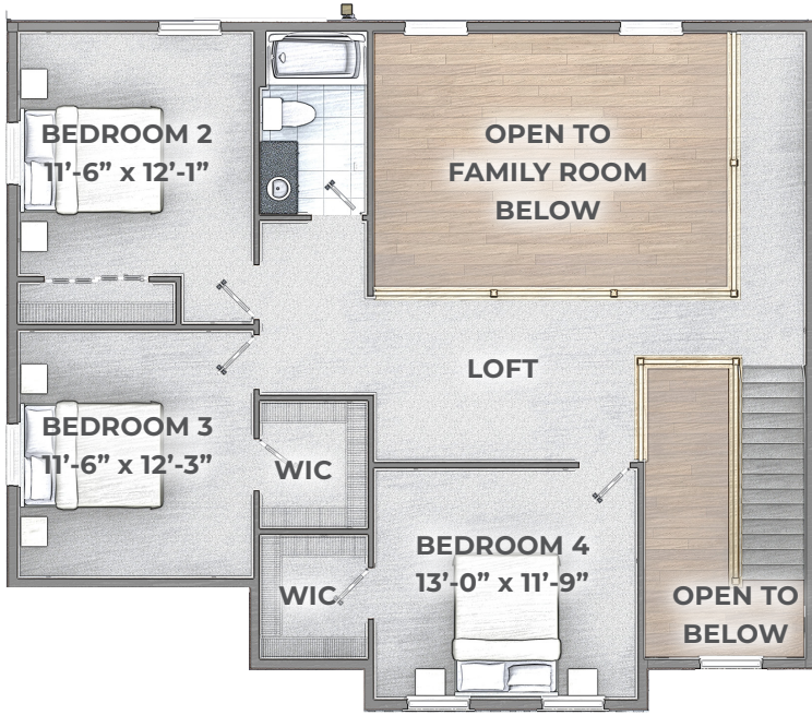
906 SQ FT - SECOND FLOOR