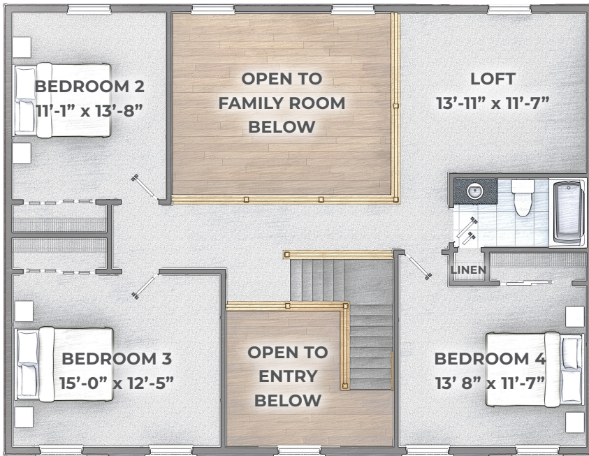
990 SQ FT - SECOND FLOOR